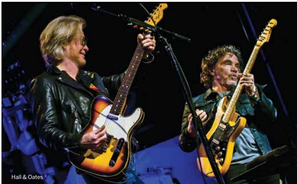
Hall &amp; Oates

With enough multiplatinum albums to tile Versailles, you'd think Daryl Hall, Rock & Roll Hall of Famer with the smoothest voice this side of Marvin Gaye might take a break. He certainly has earned the right. "Rich Girl," "Maneater," "Kiss on My List," "Private Eyes," "Out of Touch" and countless more of his eighties anthems have transcended generations, bumping Hall & Oates into a category no one can touch: top-selling duo in history.