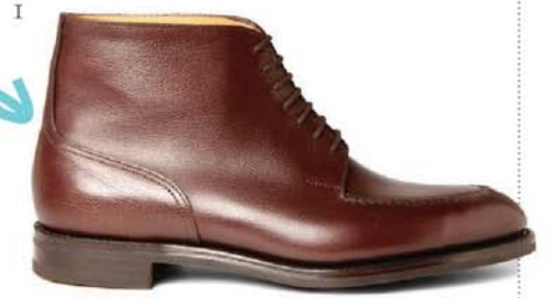
1. Chambord II leather boots, $1,180, at John Lobb

“As a London schoolboy, I desperately coveted John Lobb boots. They represent everything that is wonderful about Jermyn Street and Saville Row.”